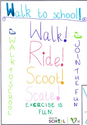
Name: Eliza Hwang Grade: 5 School: Smythdale