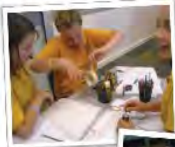
At Smythesdale, working together to alter an electrical circuit