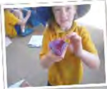
At Snake Valley, investigating how to make plasticine float on water.