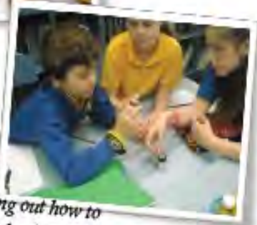
At Scarsdale, working out how to create a circuit to make the lightbulb glow.