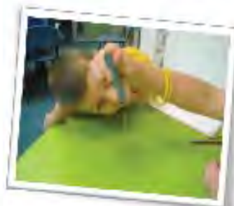
At Scarsdale, using magnetic force to make a paperclip 'float in the air.