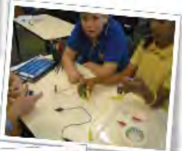
At Smythesdale, deciding what to alter in the circuit to change the glow of the lightbulb.