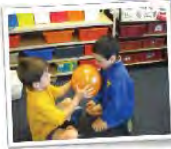
At Ross Creek, feeling the vibrations from sound on a balloon as a partner 'talks' to the balloon.