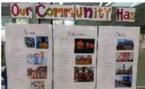
People, places and services in our community