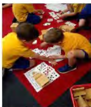
Making and sequencing numbers