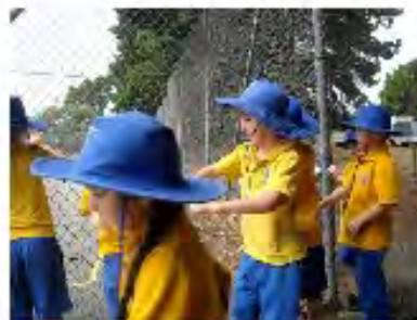
Exploring the school environment and discovering metal and wooden items.

Smythesdale and Snake Valley students have been learning about mixtures; about materials that don't mix well, and others that are difficult to separate. Students have explored how changing the quantities of materials in a mixture can alter its properties and uses