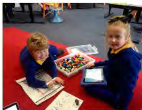
Writing and making numbers