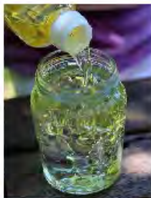
Trying to mix oil and water