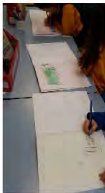
Writing about services in our community