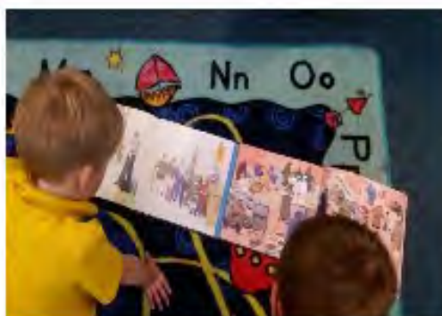
Reading to find out about communities

In mathematics our Foundation students have been busy learning about numbers; writing digits and making the amount to match. Our grade 1 and 2 students have been focusing on the place value of numbers and using the MAB to show the numbers they can make. They have been challenging themselves with numbers into the thousands! Lots of 'hands on' active learning!